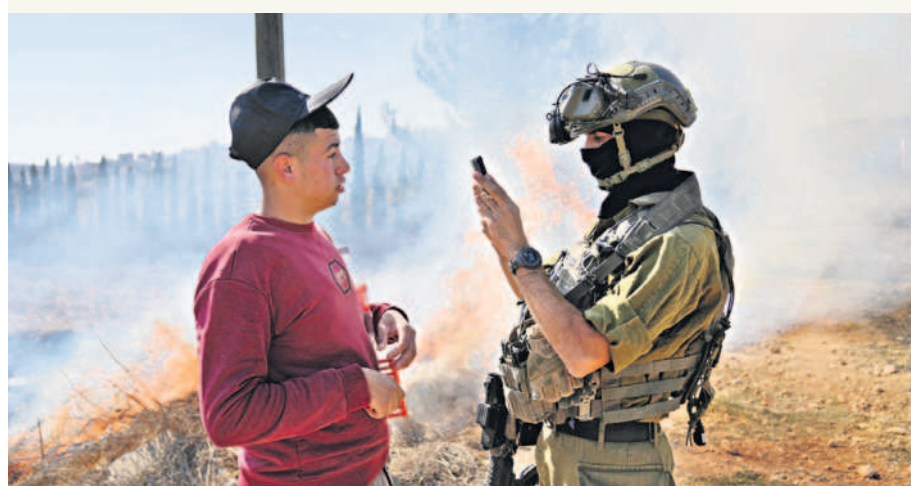
An Israeli army soldier checks the identification document of a Palestinian in the West Bank town of Qusra. An Israeli strike on a five-storey building, where displaced Palestinians were sheltering in the northern Gaza Strip, killed at least 60 people. (REPORT PAGE 9)