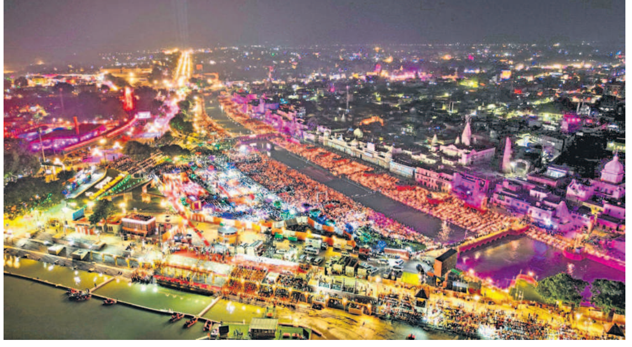
An aerial view of Ayodhya city during Deepotsav 2024 on the eve of Diwali. Two Guinness World Records — most people performing aarti simultaneously and the largest display of oil lamps — were set at the eighth edition of the Deepotsav on Wednesday. The two records were set in the holy city with over 25 lakh diyas lit together and 1,121 'vedacharyas' performing aarti simultaneously.