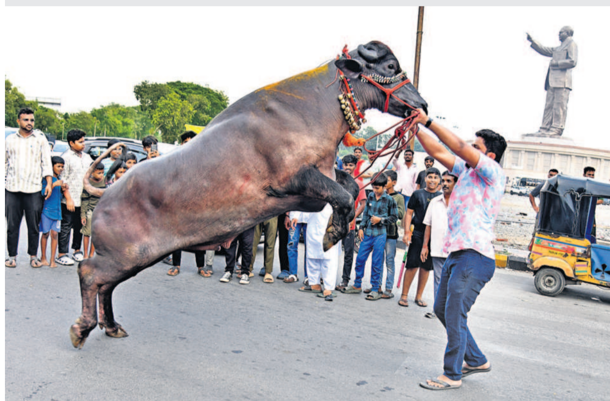
A man performs a stunt with a buffalo as part of Sadar festivities, near the Secretariat in Hyderabad on Friday.