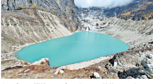
According to CWC report, the region saw a 10.81 per cent increase in area from 2011 to 2024 due to climate change.

The Central Water Commission's (CWC) report states that with a 33.7 per cent expansion of the surface area, the lakes in India experienced an even more substantial rise.