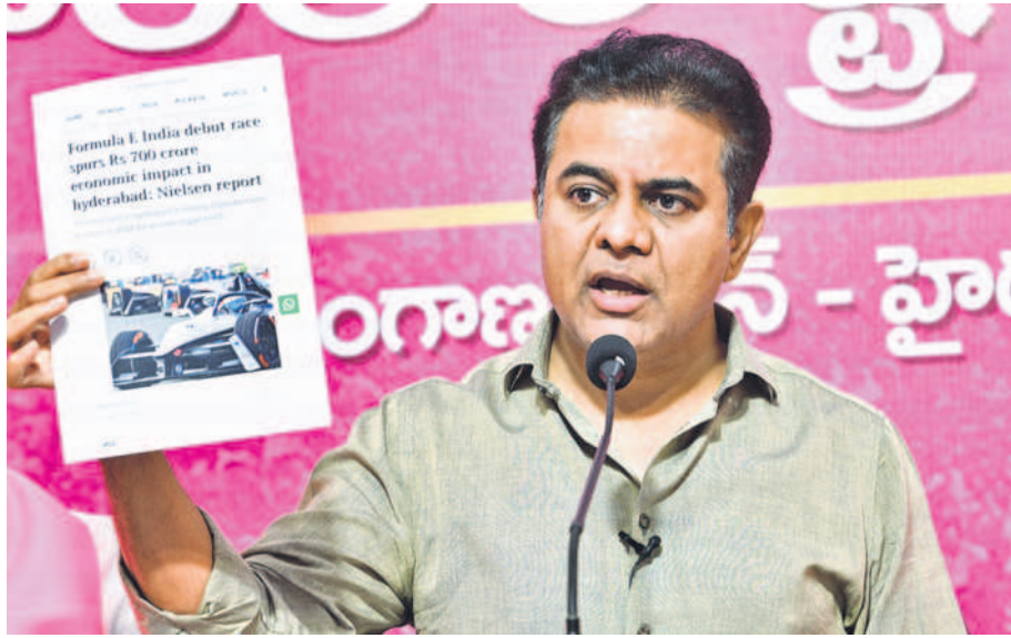
BRS working president KT Rama Rao addressing the media at Telangana Bhavan on Thursday.