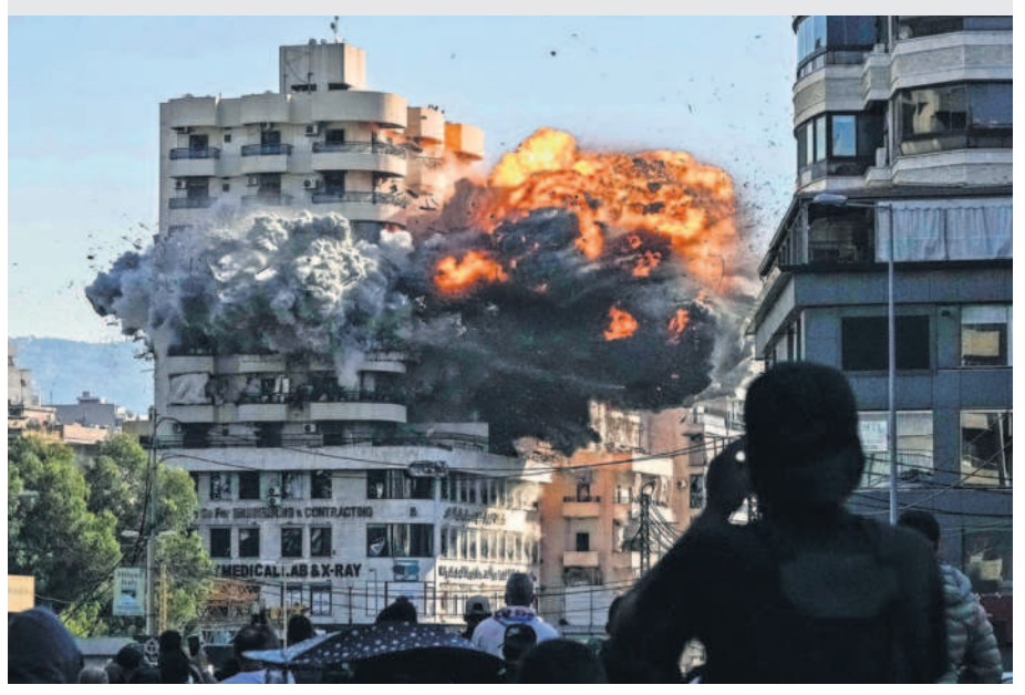
Smoke and flames erupt from a building hit in an Israeli airstrike in Chivah, in the southern suburb of Beirut, Lebanon, on Friday. (RELATED REPORTS PAGE 9)