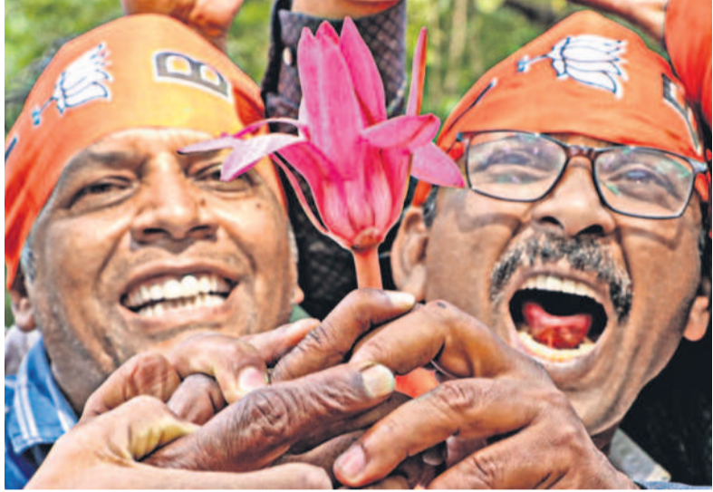
BJP workers celebrate the party's lead in the Maharashtra Assembly elections, in Nagpur on Saturday.

Buzz over Fadnavis as next Maha CM; BJP's 'infiltrators' pitch falls flat in J'khand