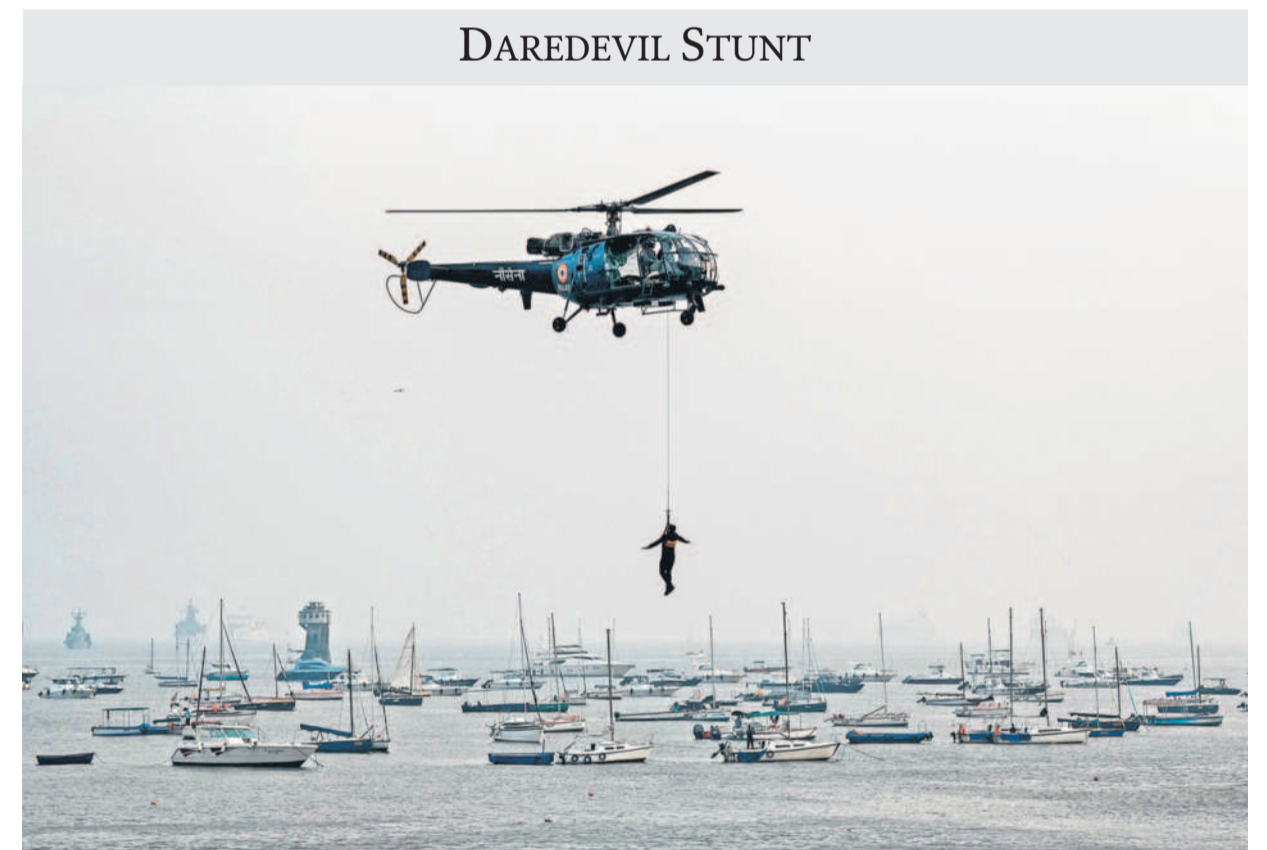
Indian Navy's marine commandos demonstrate their skills during Navy Day celebrations, in Mumbai on Sunday.