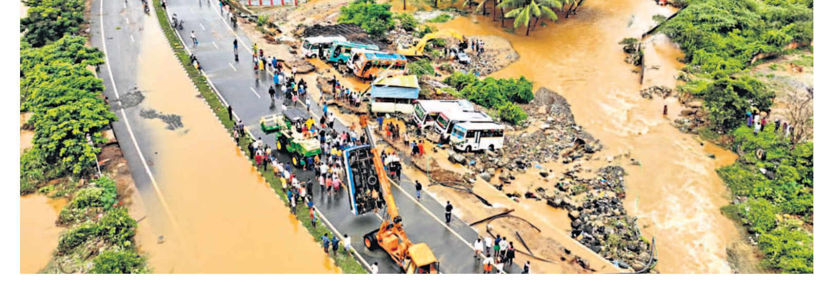
A crane lifts a damaged vehicle in flooded Uthangarai following heavy rain in the aftermath of Cyclone Fengal, in Krishnagiri, Tamil Nadu. (REPORTS PAGE 7) O

he attacked her on head and have waylaid and murdered neck, hacking her to death her. (SEE PAGE 2)