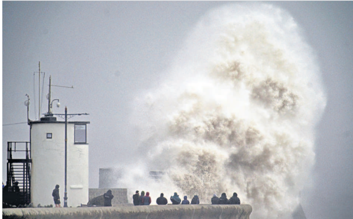
Waves crash during Storm Darragh over the seafront in Porthcawl in Wales on Saturday. A man died and hundreds of thousands of people in Britain and Ireland were left without power as high winds and heavy rain battered the region.