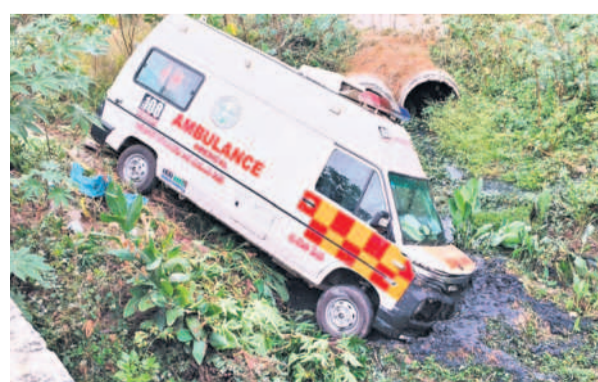
The 108 ambulance which was stolen from a hospital in Hayathnagar on Hyderabad's outskirts.

In a true filmy style, a thief stole an ambulance parked at a hospital in Hayathnagar on the city outskirts and drove about 150 km as police vehicles chased him down before taking him into custody at Suryapet. An Assistant Sub-Inspector, who tried to intercept the vehicle, was injured when the thief hit him with the ambulance. The ASI's condition is stated to be critical. The drama unfolded at a private hospital at Hayathnagar on Saturday morning when the driver of the am-