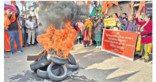
People protest the atrocities on religious minorities in Bangladesh, at Bhadarwah in Doda district of J&K on Saturday.