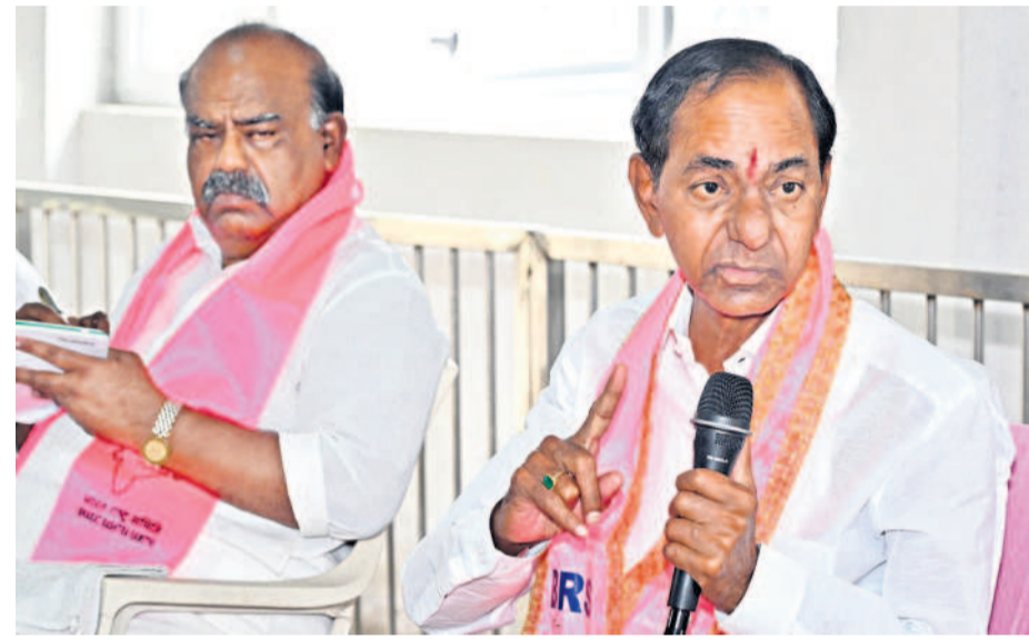
BRS president and Opposition leader K Chandrashekhara Rao at a meeting of the Legislative Party with party MLAs and MLCs at his residence in Erravelli on Sunday.

Releasing an 18-page charge sheet on the one-year Congress rule at Telangana Bhavan on Sunday, Harish said the Congress government started its term with a negative attitude and controversial decisions such as attempts to alter the State emblem, cancel key projects such as Pharma City and impose restrictive measures on businesses in Hyderabad. (SEE PAGE 2)