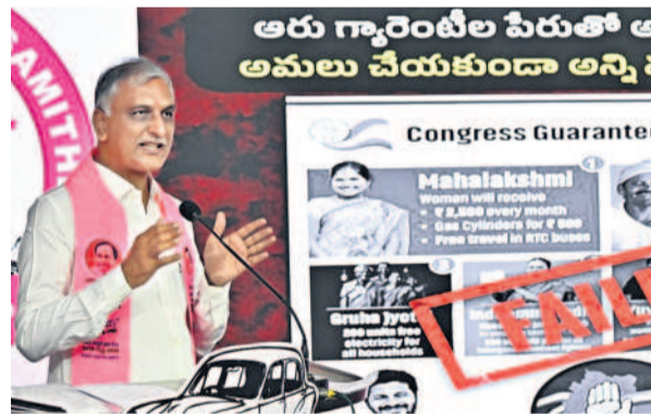
BRS MLA Harish Rao releasing a charge sheet against the Congress government, at Telangana Bhavan on Sunday.