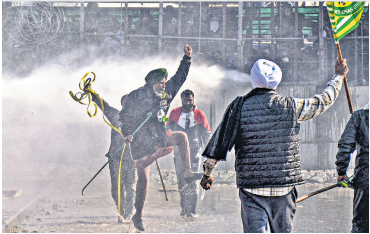
Security personnel use water cannons to disperse farmers agitating at Shambhu border in Patiala district, on Saturday. A 'jatha' of 101 farmers resumed their foot march to Delhi from the border to press the Centre for various demands. (REPORT PAGE 7)