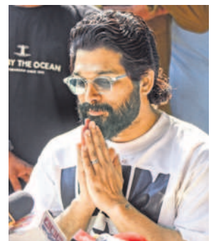
Actor Allu Arjun at his residence in Hyderabad.

The actor had to spend the night in Central Prison Chanchalguda after the jail authorities did not release him, citing a delay in furnishing bail documents. Allu Arjun was accommodated in Manjeera Barrack and was issued a UT (under trail) number 7697. On Friday, the actor was