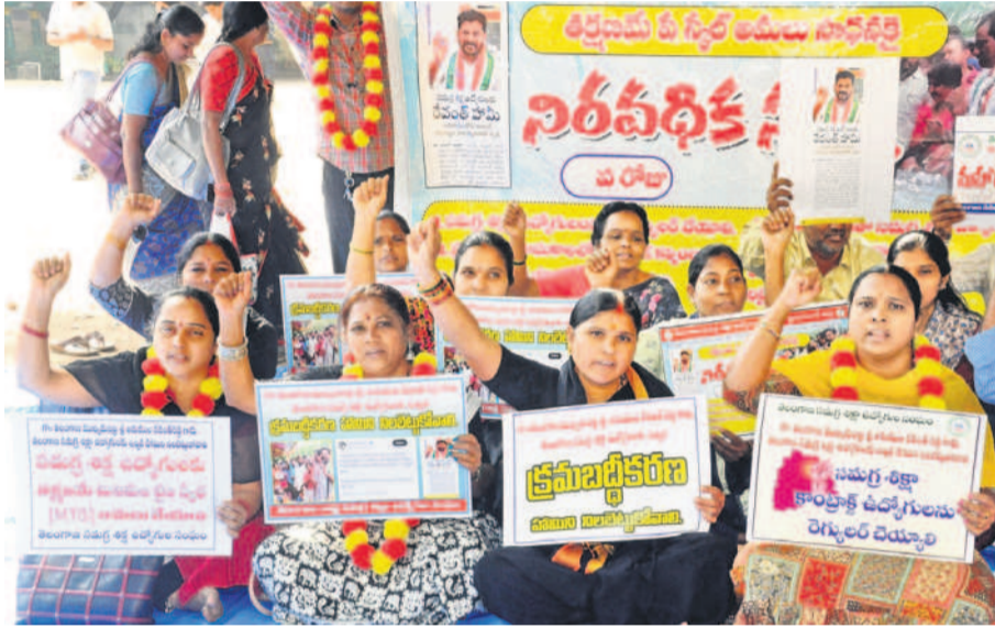
Apart from the KGBV employees, other staff inducted under the Samagra Shiksha Abhiyan into the Education Department, too, have gone on strike.

The KGBVs have played a vital role in offering free residential education to orphaned, semi-orphaned and poor girl students over the years. During the last week, there has been no classroom