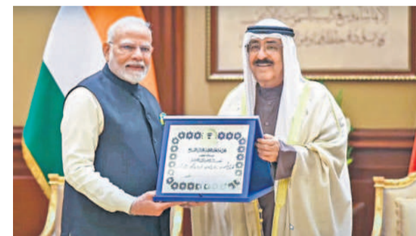
Prime Minister Narendra Modi being conferred with Kuwait's highest honour, 'The Order of Mubarak Al Kabeer', by Amir of Kuwait Sheikh Meshal Al-Ahmad Al-Jaber Al-Sabah.

Besides the Emir, Modi held separate talks with Kuwaiti Prime Minister Ahmad Abdullah Al-Ahmad Al-Sabah and Crown Prince Sabah Al-Khaled Al-Hamad Al-Mubarak Al-Sabah with a focus on giving new momentum to the overall bilateral ties. The two sides signed four agreements, including