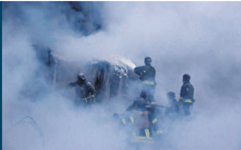
WORLD | PAGE 09 Russia bombs Ukrainian energy infra on Christmas Launches 78 air, ground and sea-launched missiles, 106 Shahed and other drones