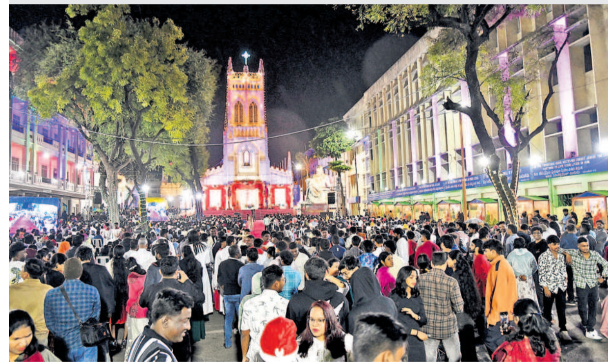
People gather at St Mary's Basilica in Secunderabad on Christmas Day.