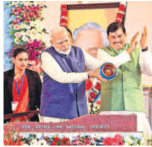
NATION | PAGE 07 Modi kick-starts Ben-Betwa project