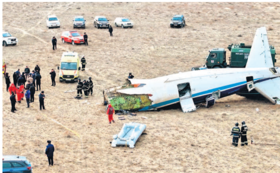
Wreckage of Azerbaijan Airlines Embraer 190 near the airport of Aktai in Kazakhstan.

29 survive; weather forces Embraer 190 to change its planned course