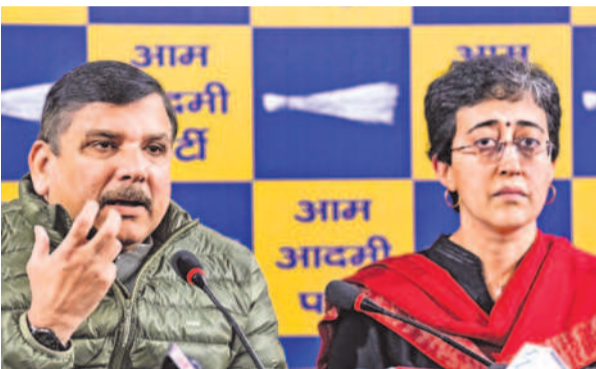
Delhi Chief Minister Atishi and AAP leader Sanjay Singh addressing the press conference, in New Delhi on Thursday.

Singh accused Congress leaders Ajay Maken and Sandeep Dixit of targeting AAP instead of focusing on the BJP. "Ajay Maken has crossed all limits by calling Arvind Kejriwal anti-national. Despite campaigning