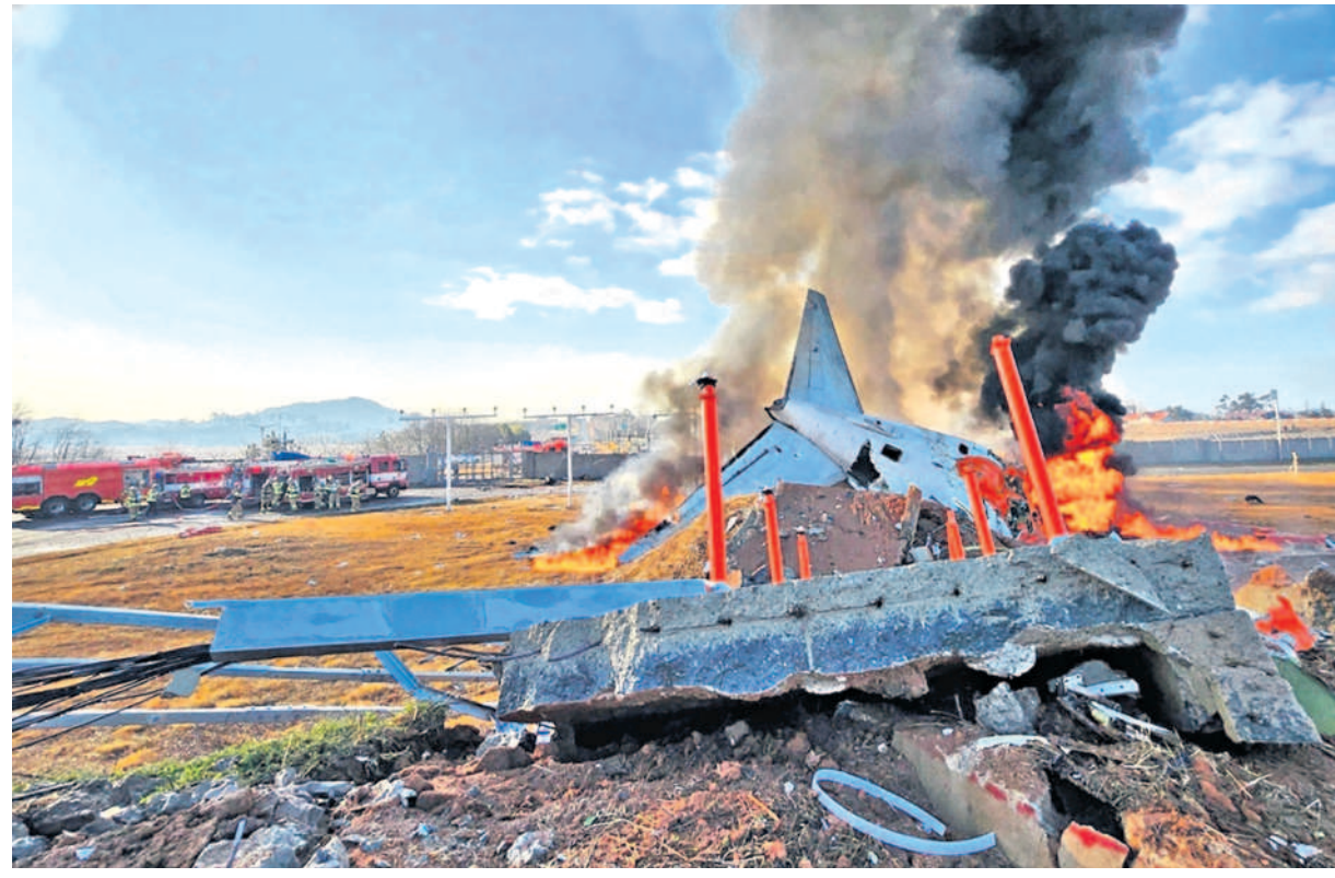
The passenger plane in flames at the Muan International Airport in Muan, South Korea, on Sunday.

The fire agency deployed 32 fire trucks and several helicopters to contain the