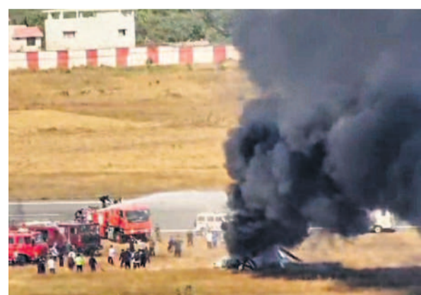
Rescue work under way after a helicopter of the Indian Coast Guard crashed during landing at Porbandar airport.