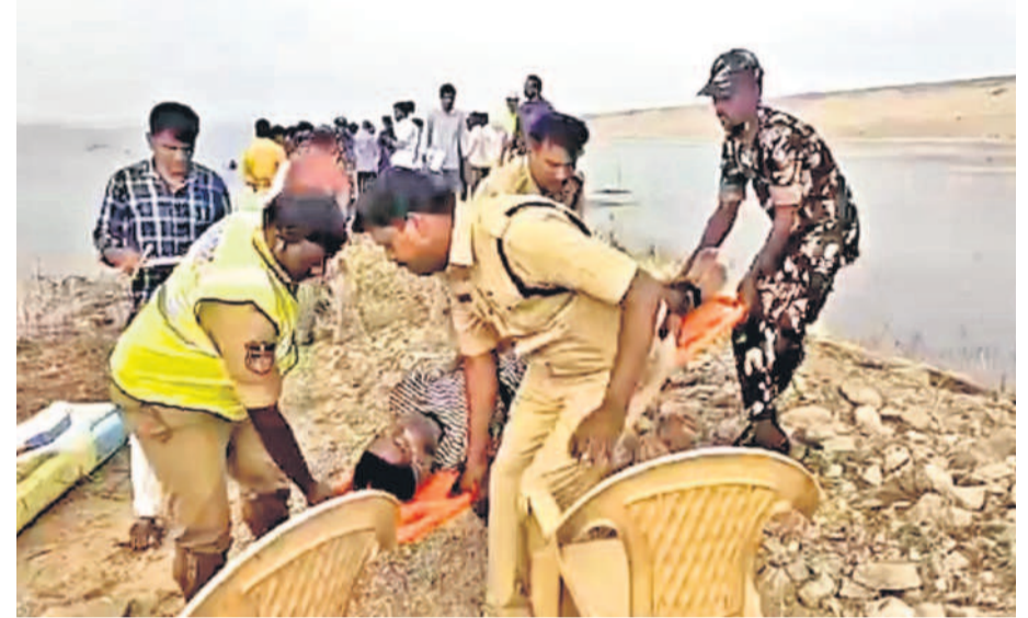
Police officials retrieve the body of one of the youngster who drowned, on Saturday.

They arrived at Kondapochamma, built as part of the Kaleshwaram project at Markook, on two-wheelers. While shooting videos and selfies, the teenagers ventured a bit deep into the reservoir where massive pits were dug while building the project. When one of them slipped into the pit, the rest followed him while trying to rescue him. However,