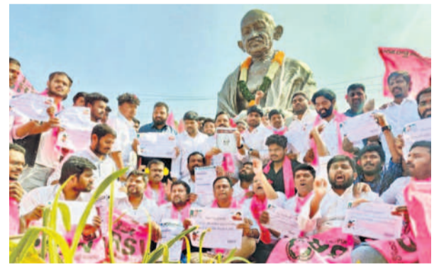
BRS leaders and workers protesting the Congress government's failure to implement its 420 promises, on Thursday.

The protests coincided with Mahatma Gandhi's death anniversary, with leaders pointing out key welfare schemes that remain unfulfilled, including