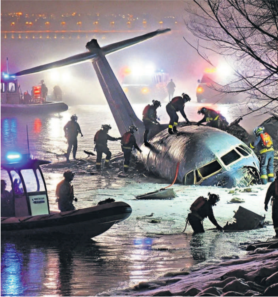
Rescuers searching for passengers and crew members after an American Airlines jet collided with a US Army helicopter, in the Potomac river in Washington on Thursday.

There was no immediate word on the cause of the col-