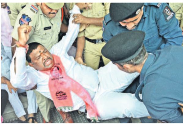
A BRS corporator being detained during the protest in Hyderabad on Thursday.

He criticised the arrests, stating that corporators were detained for raising concerns over the lack of funds for the city in the GHMC Governing Council meeting. "Is it a crime to question why Hyderabad is being ignored? If we ex-