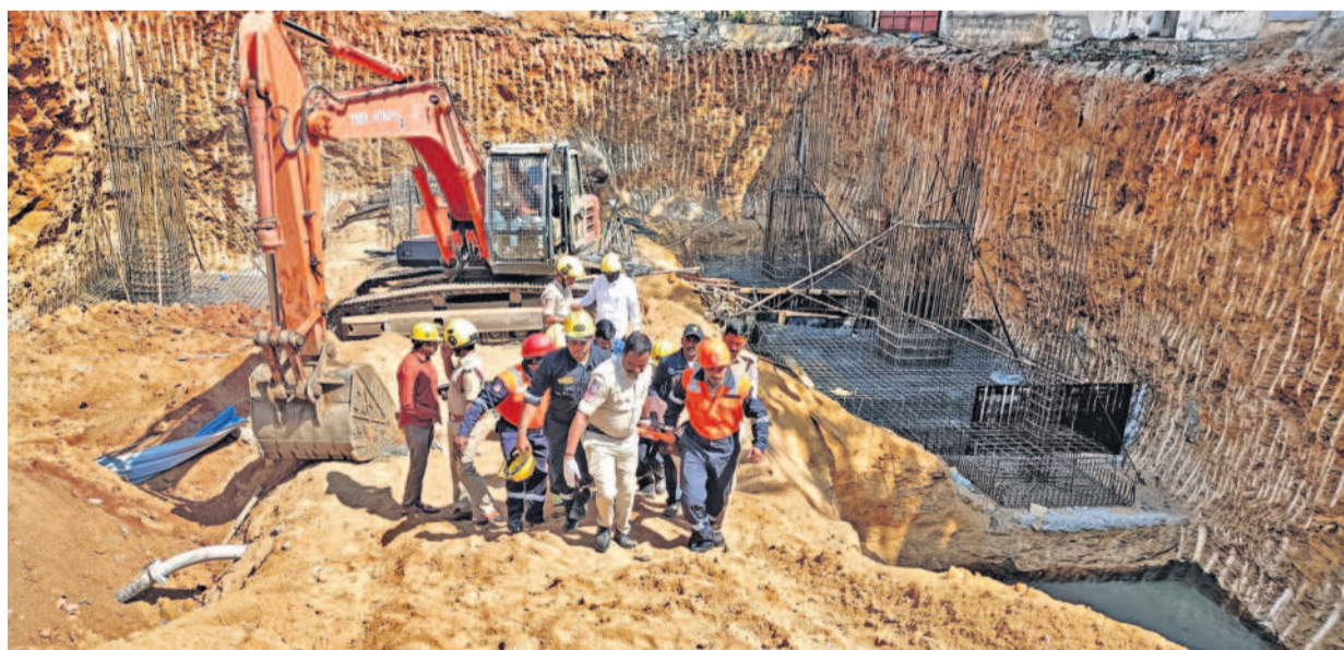
Rescue workers at the site where a huge portion of a retaining mud wall collapsed in LB Nagar, Hyderabad.

The incident occurred when the workers with the help of earth excavators were digging up the ground to construct the basement for an upcoming hotel. According to the police, the workers were on the basement area just adjacent to the mud wall, when the wall, which had allegedly become weak, suddenly collapsed on them.