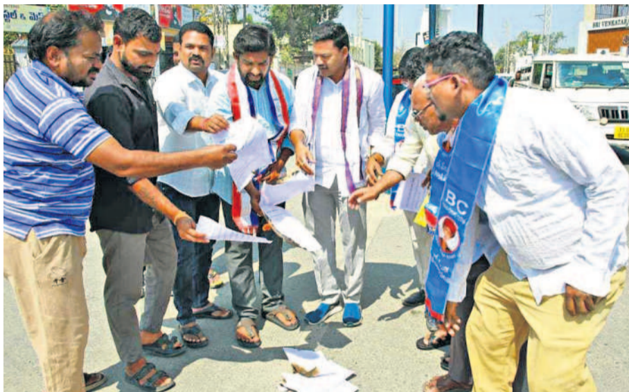
BC leaders burning Congress government's caste census survey report in Nalgonda on Wednesday.

"It was crucial for the party's national strategy to present a statement on the caste survey in Telangana, especially since Karnataka's report has been stalled for seven years. The Karnataka leadership itself is divided on making it public," a senior Congress leader admitted. However, the move backfired in Telangana, where BC leaders are now demanding that the government implement a 42 per cent reservation in the up-