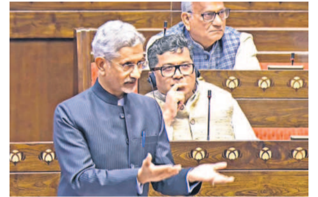
EAM S Jaishankar speaks in the Rajya Sabha during the Budget session of Parliament, in New Delhi on Thursday.

A US military aircraft carrying 104 illegal Indian immigrants landed at the Amritsar airport on Wednesday. This was the first batch of Indians to be deported by the Donald Trump administration as part of a crackdown against illegal immigrants. Jais-