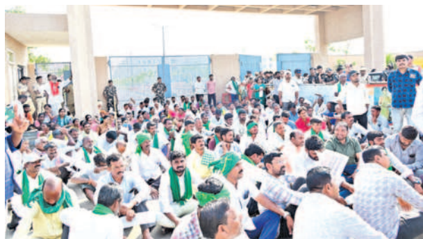
Farmers staging a protest against the proposed pharma project, at the Rangareddy district Collectorate, on Saturday.

Plans are being made to acquire over 2,000 acres from 1,000 farmers in Medipally, Nanaknagar, Tadiparthi and Kurmidla villages under Yacharam mandal. They also filed a petition in the court against the acquisition of their lands. It is learnt that the Rangareddy