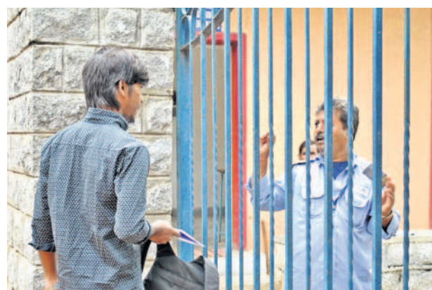
During a recent meeting convened by the TGCHE, it was decided to introduce 15-minute early entry clause instead of one-minute rule.

This means the students must be inside the gates at least 15 minutes prior to the commencement of the examination and entry is barred after reporting time.