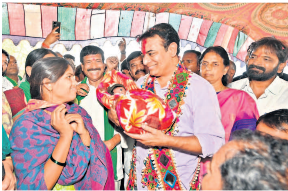
BRS working president KT Rama Rao participating in the Rythu Maha Dharna at Kosgi, Narayanpet district, on Monday.

Lambadi women were forced to travel to Delhi to seek justice, the BRS working president added, condemning the government's midnight police raids on vil-