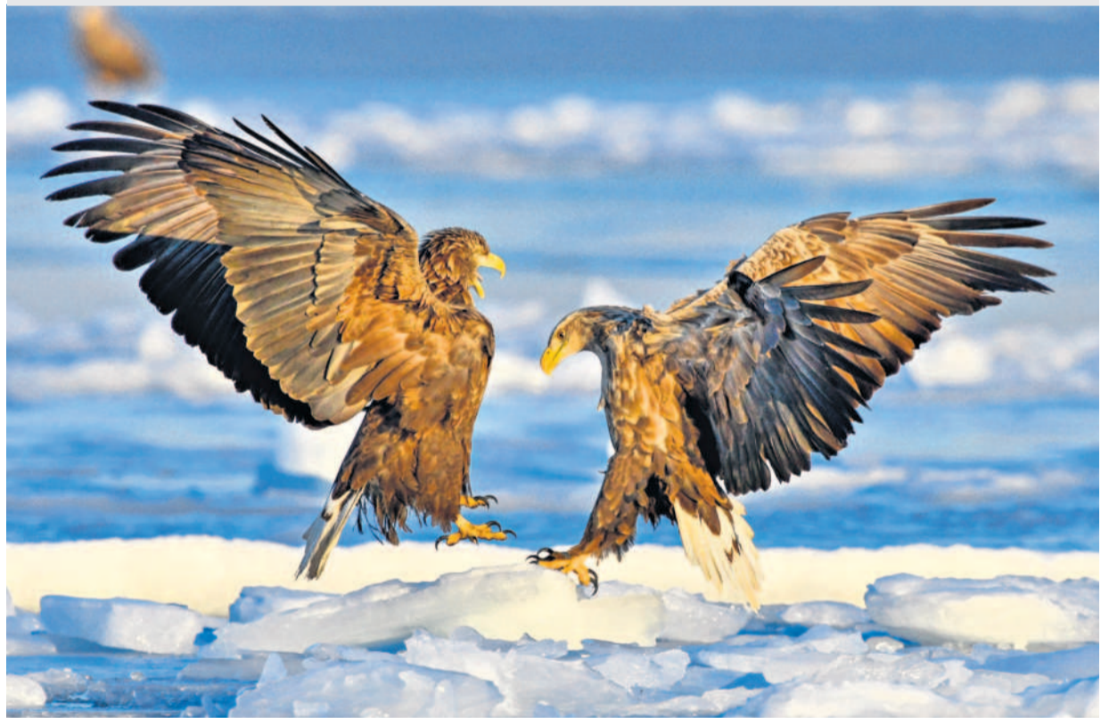
White-tailed eagles fight while hunting at the Bosfor Vostochny channel in Vladivostok, Russia, on Monday.