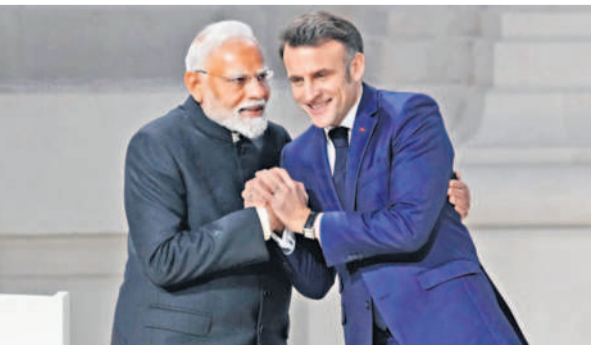
Prime Minister Narendra Modi with French President Emmanuel Macron during the AI Action Summit in Paris.

Co-chairing the AI Action Summit along with French President Emmanuel Macron here, Modi said that AI is changing the polity, economy, security and society, and is writing the code for humanity in this century. "There is a need for collective global efforts to es-