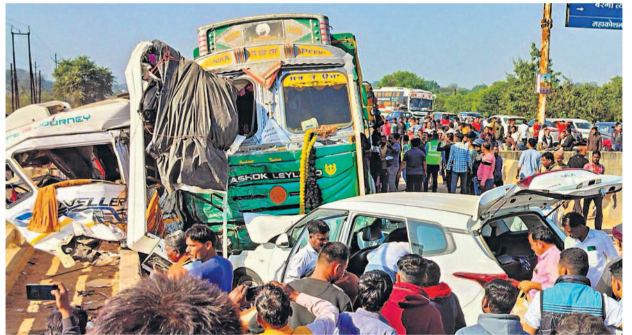
People gather near the mangled remains of the minibus that met with an accident at Sihora in Jabalpur on Tuesday.

All the victims are residents of Nacharam, Saroornagar and Tarnaka in the city. The group hired a minibus and left the city on Saturday to visit the Maha Kumbh Mela. After taking a holy dip on Monday and resting in the night, they started for Hyderabad on Tuesday morning when around 9.30 am, the accident