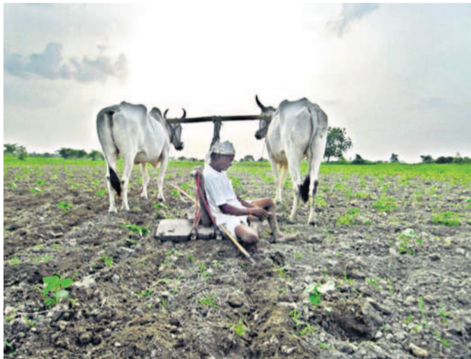
Rythu Bandhu, launched in 2018 to help farmers in distress and prevent suicides, was altered by the Congress government to Rythu Bharosa.

The joy of farmers in Telangana has turned into disappointment as the State government's promised disbursement of crop investment support under the Rythu Bharosa scheme is eluding many. Around eight lakh acres, previously included for support under the Rythu Bandhu scheme, are no longer on the list. The status of another five lakh acres is also under scrutiny, with the farmers of such holdings to cease getting the benefit. Rythu Bandhu, launched in 2018 to help farmers in distress and prevent suicides, was altered by the Congress government to Rythu Bharosa with some tweaks. Initially, the government promised to increase the assistance from Rs 5,000 to Rs 7,500 per acre for each crop season (Kharif and Rabi). But they increased it only to Rs 6,000 per acre,