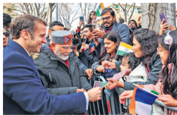
Prime Minister Narendra Modi and French President Emmanuel Macron during the inauguration of the Indian Consulate in Marseille, France. (REPORT PAGE 7)