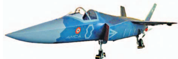
VEM Technologies has made its mark in AMCA.

A Hyderabad-based company has become the heart of India's upcoming next generation fighter aircraft AMCA. VEM Technologies Private Limited has made its mark in the Advanced Medium Combat Aircraft (AMCA), manufacturing end-to-end modules besides assembling and integrating the entire aircraft. The AMCA was recently unveiled by Defence Minister Rajnath Singh in the ongoing Aero India 2025 at