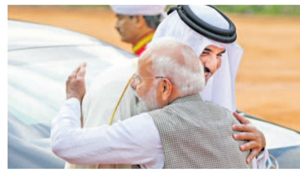
Prime Minister Narendra Modi greets Amir of Qatar Sheikh Tamim Bin Hamad Al Thani in New Delhi.