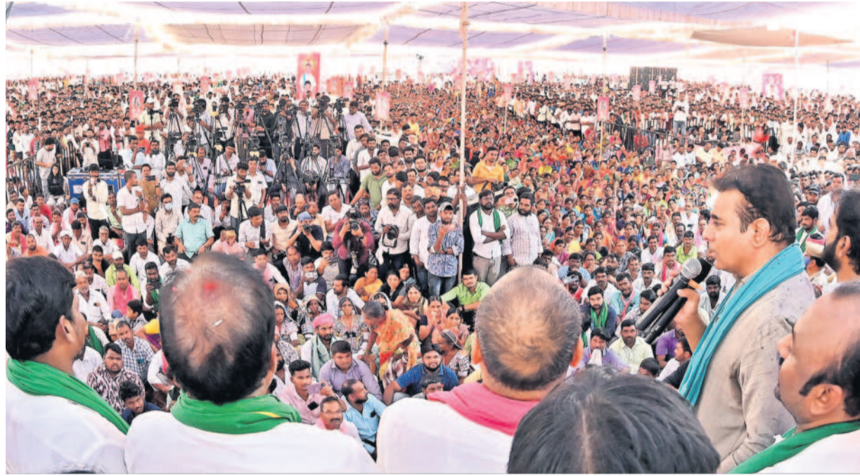
BRS working president KT Rama Rao addressing a massive gathering of farmers as part of the Rythu Maha Dharna at Amangal.

Says over 430 farmers died by suicide in the last one year