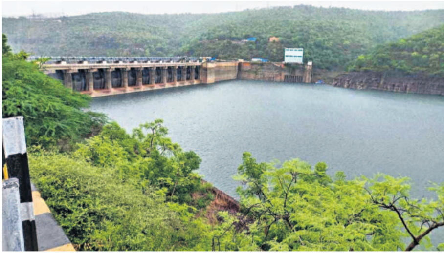
Major deterioration in the plunge pool area downstream of the spillway threatens the structural integrity of the Srisailem dam.

Additionally, it supports irrigation and drinking water supply to vast regions in both states and is integral to the Telugu Ganga Project,