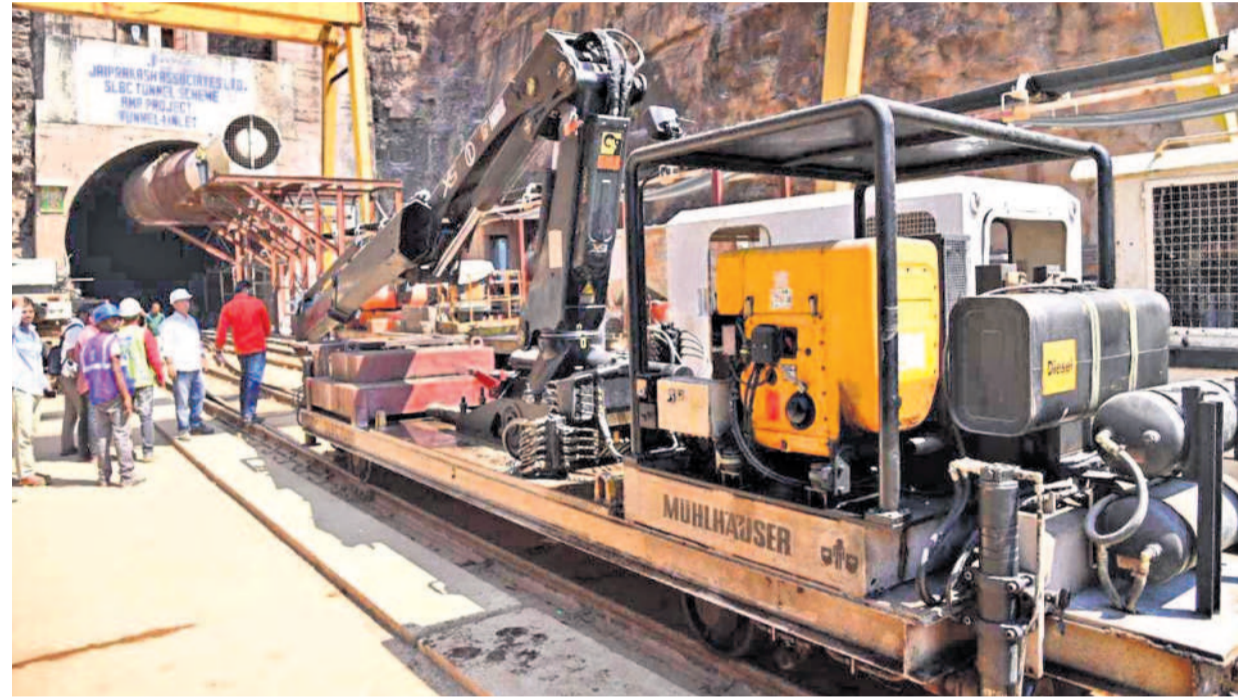
The SLBC project site where a portion of the tunnel collapsed, in Nagarkurnool district on Tuesday.

Site inundated with water up to 13 ft: Uttam Meanwhile, later addressing the media, Irrigation Minister N Uttam Kumar Reddy said that the natural rock formations inside the SLBC