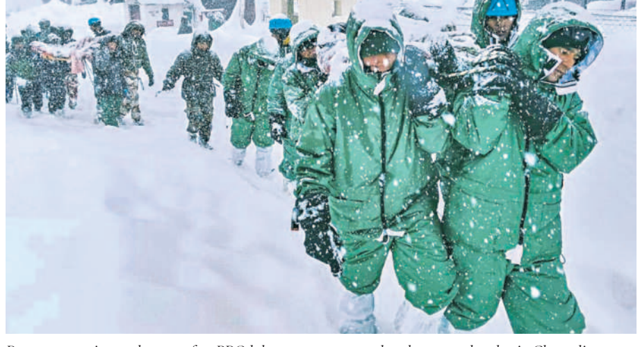
Rescue operation underway after BRO labourers got trapped under an avalanche, in Chamoli district of Uttarakhand on Friday.

Four of those rescued are reported to be in a critical condition, the Army PRO said. All 32 have been taken to the ITBP camp in Mana for treatment, the sources said. Mana, three kilometres from Badrinath, is the last village on the India-Tibet border at a height of 3,200