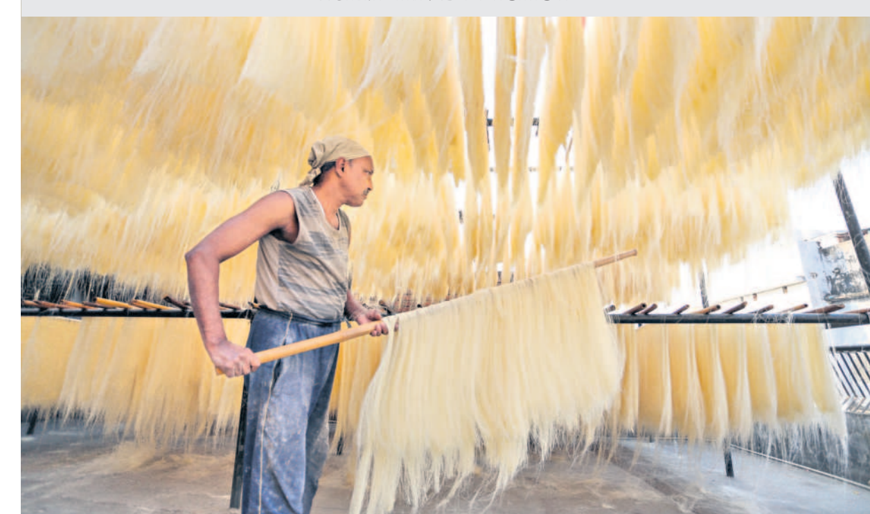
A worker prepares vermicelli, which is used in making traditional sweet dishes, ahead of the holy month of Ramzan, in Prayagraj on Saturday.