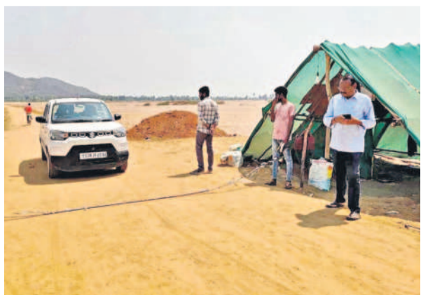
The illegal toll gate near Kistampet in Peddapalli district.

What is more surprising is that an illegal tender process was also carried out for collecting toll on this