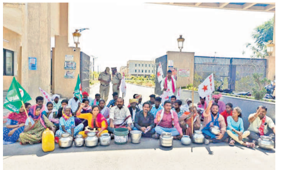
Residents from Enoli village in Wankidi mandal staging a sit-in in front of the Integrated District Offices Complex in Asifabad on Wednesday.

However, the tribals were not allowed to enter the IDOC. ASP S Chitharanjan held consultations with the agitators and assured to address the problem by digging bore wells. The tribals were not satisfied with the intervention of the ASP. They continued to stage the