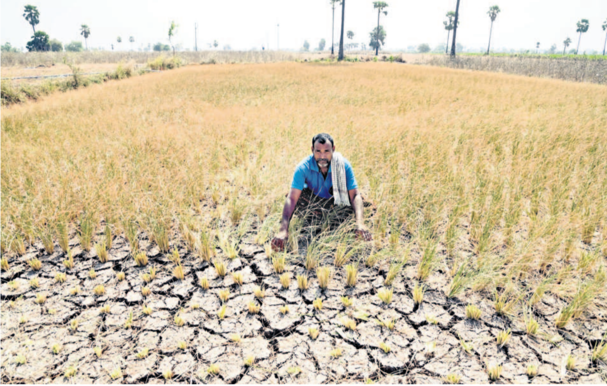
Dried up crops at an agricultural field at Pittampally village of Kattangur mandal in Nalgonda district.

Since the introduction of this initiative on January 1, 2018, farmers have benefited from transitioning from rainfed agriculture to irrigated systems, boosting crop production and income. This success story, however, came with challenges. The State has had to make substantial investments in higher generation and distribution capacities, leading to increased electricity consumption in the farm sector and proportionate rise in production of food grains. Providing free power means that the State's subsidy burden also increased. But farmers being the priority, BRS president