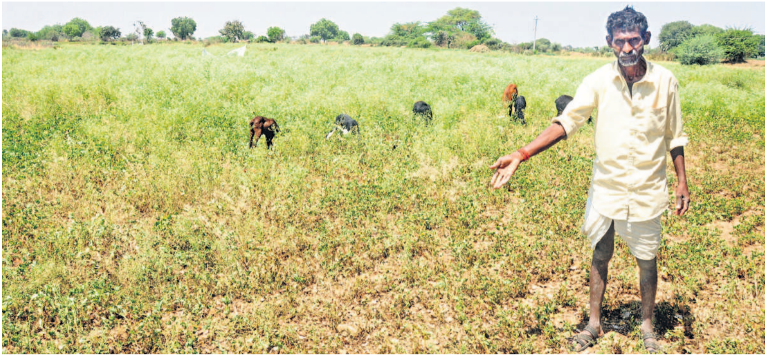
A farmer shows his dried up field in Narayanpet of Dhanwad mandal on Thursday.

The once-thriving Godavari basin, which saw a considerable rise in groundwater levels due to consistent water lifting operations, is now facing a severe groundwater crisis. The Kaleshwaram barrages — Medigadda, Annaram and Sundilla — had maintained maximum water