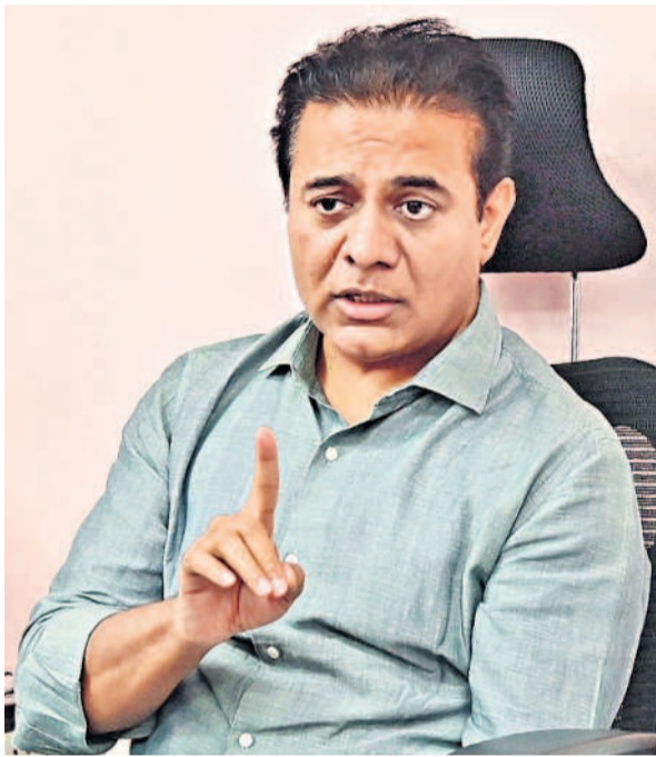
BRS working president during an informal interaction with the media at the BRS Legislative Party office on Monday.

In an informal interaction with the media at the BRS Legislative Party office here on Monday, Rama Rao said Revanth Reddy, along with four real estate brokers, was manipulating the system for