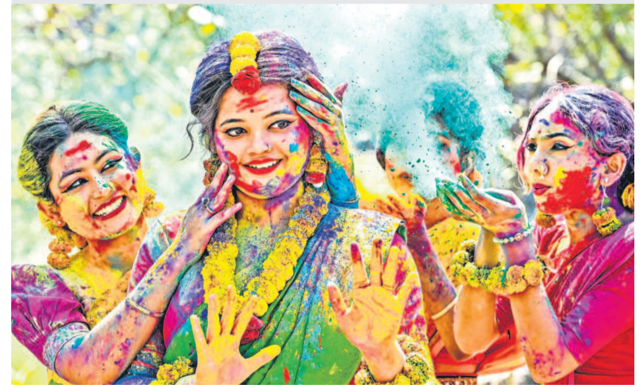
Women play with 'gulaal' ahead of Holi festival in West Bengal's Nadia on Monday.