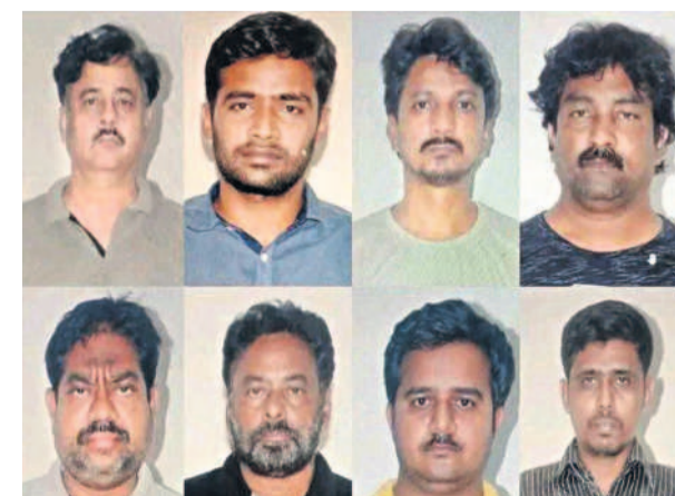
In September 2018, eight people, including the woman's father and uncle, were arrested. Six of the accused have been given life.