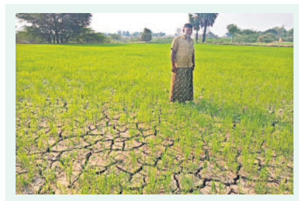
Rabi farmers in the Godavari basin projects in Telangana are grappling with a severe water crisis.

Rabi farmers in the Godavari basin projects in Telangana are grappling with a severe water crisis. The Sripada Yellampalli project, which has a gross storage capacity of 20.18 TMC, currently holds only 12 TMC of water. This is significantly below the minimum requirement of 15 TMC needed for drinking water supply to the command area towns and villages, including Hyderabad, which relies on this project for emergency drinking