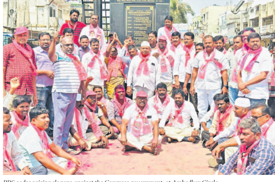
BRS cadre raising slogans against the Congress government, at Ambedkar Circle in Nagarkurnool district on Friday.

On the occasion, BRS working president KT Rama Rao called for Statewide protests on Friday. Accordingly, the BRS cadre organised protests at major junctions in all constituency and district headquarters across the State. They burnt the ef-