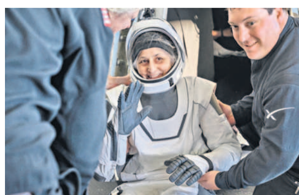
NASA astronaut Sunita Williams is helped out of a SpaceX Dragon spacecraft in Florida.

The capsule was then carried to the recovery ship, where Hague became the first to exit the spacecraft nearly 50 minutes after splashdown. Williams emerged third. All three