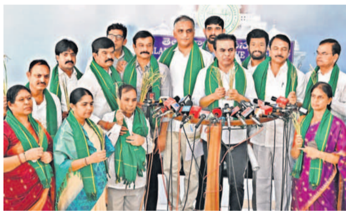
BRS working president KT Rama Rao addressing journalists at the Telangana Assembly Media Point in Hyderabad on Wednesday.

The bond papers circulated in the public with an assurance to implement the Congress guarantees that were undersigned by Mallu Bhatti Vikramarka and A Revanth Reddy had now become things of the past, he said. Calling