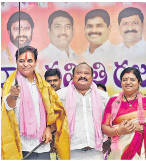
BRS working president KT Rama Rao during a meeting of party activists in Karimnagar on Sunday.

STATE BUREAU HYDERABAD Castigating the Congress government for its repeated failures, BRS working president KT Rama Rao emphasised the need to bring back party president and former Chief Minister K Chandrashekhara Rao to power for setting the State back on the development track. He blamed Congress for manipulating public sentiment to win the elections and now, betraying them. "The defeat of BRS was not the people's fault. A criminal misled them with hatred against Chandrashekhara Rao to win elections. We too failed to publicise the good work done under BRS regime. Now, Telangana is paying the price. The so-called 'Indiramma Rajyam' has only brought suffering," he said. Addressing a meeting of party activists in Karimnagar on Sunday, Rama Rao said the Congress had pushed Telangana into a crisis, with farmers suffering severe distress. "Loan waivers remain incomplete, crop losses are ignored, and agriculture is in crisis. Our leader Chandrashekhara Rao had warned that voting for Congress would destroy the