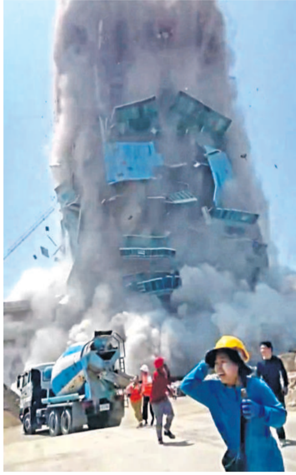
A high-rise building collapses during the earthquake in Bangkok, Thailand, on Friday. (RELATED REPORTS PAGE 9)

Photos from Myanmar's capital, Naypyidaw, showed rescue crews pulling victims from the rubble of multiple buildings used to house civil