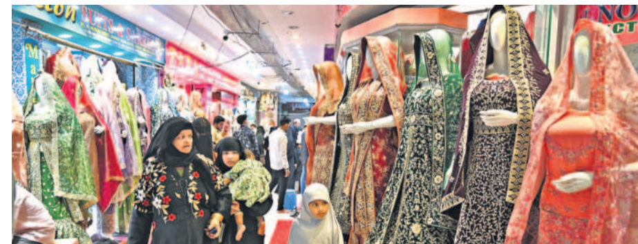
People shop for clothes ahead of Eid ul Fitr, in Old City on Saturday.

The markets around Charminar, Abids, Tolichowki, Musheerabad, Ameerpet and Dilukhannagar are brimming with buyers who are shopping for traditional wear, footwear, crockery, bangles and other articles. Eid ul Fitr is likely to be celebrated on Monday. In old city, the rush of shop-