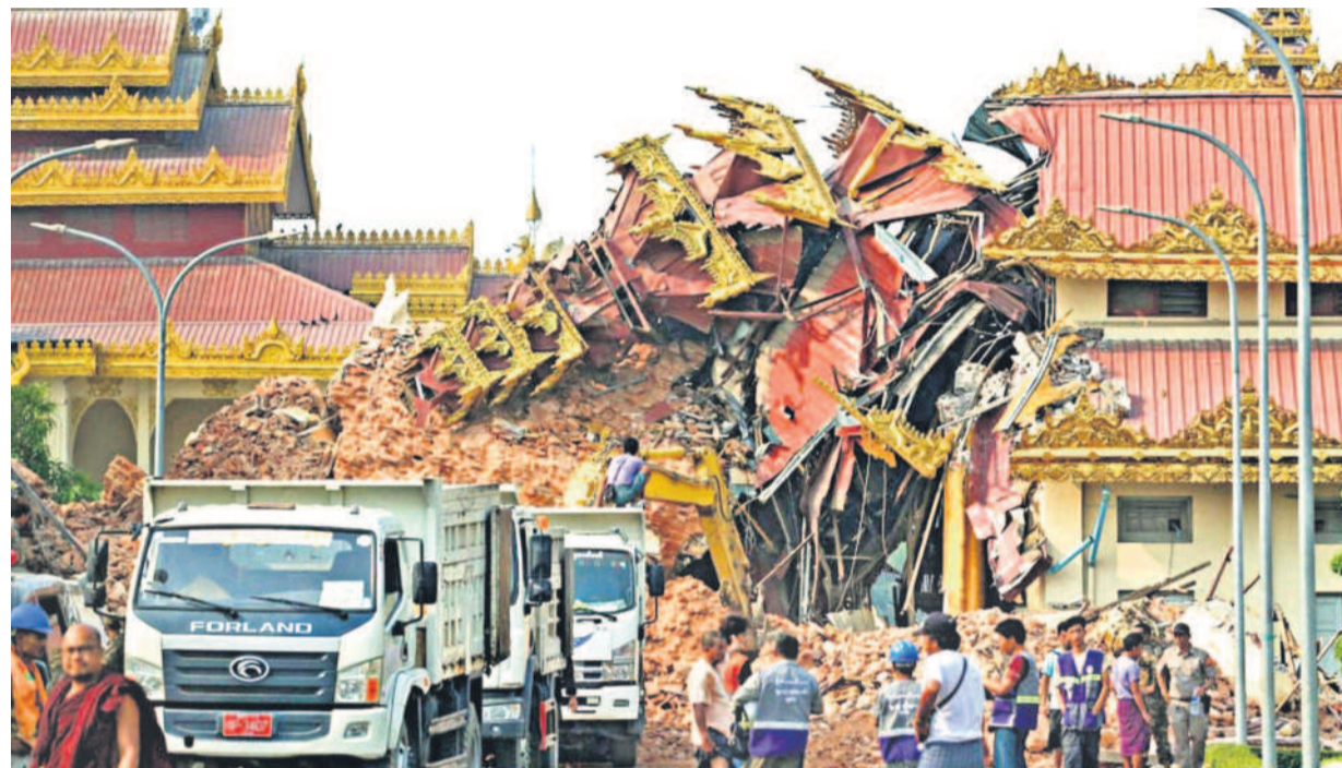
Locals gather near a collapsed building in the aftermath of the earthquake, at Mandalay in Myanmar on Saturday.

Myanmar's ruling military said on Saturday on state television that the confirmed death toll from a devastating 7.7 magnitude earthquake rose to 1,644, as more bodies were pulled from the rubble of the scores of buildings that collapsed when it struck near the country's second-largest city.