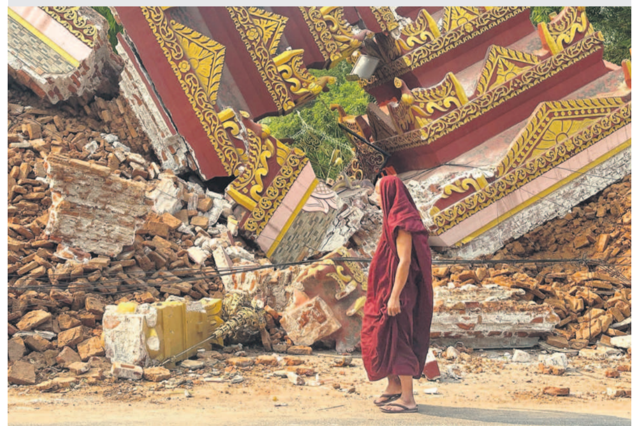
A Buddhist monk walks past a collapsed pagoda after the earthquake, in Mandalay, central Myanmar, on Sunday.