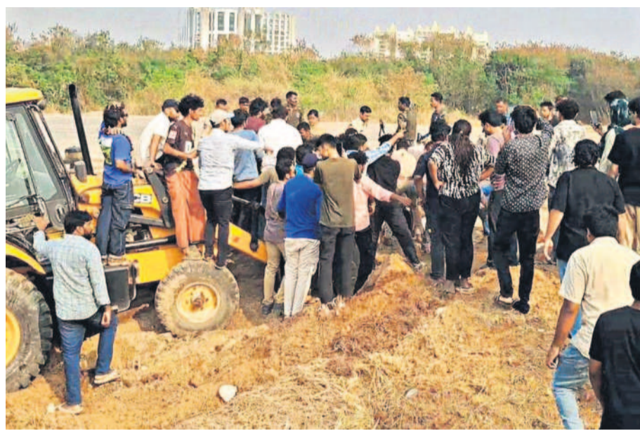
Students protest against clearing forest land at the UoH east campus, in Hyderabad on Sunday.

Cops drag them by hair and feet, release them late at night